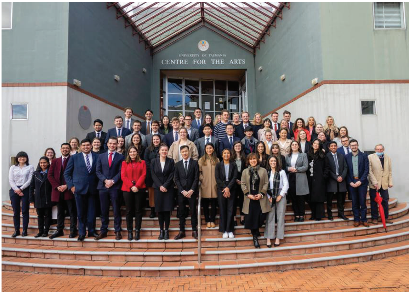
2023 TLPC Graduates